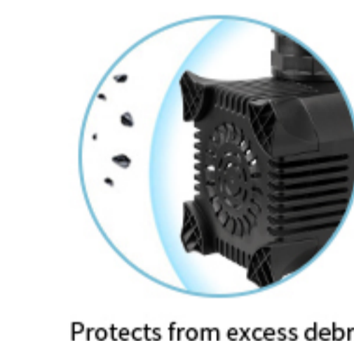
Protects from excess debris