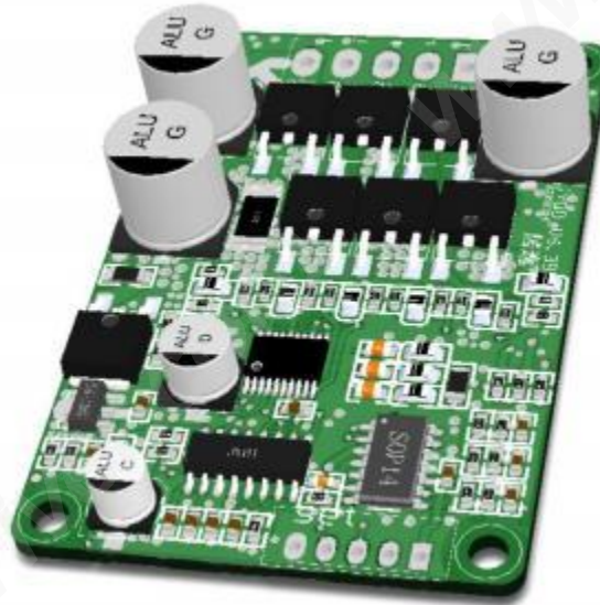
Driver Board Diagram