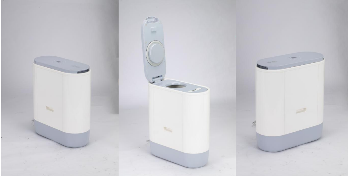
2 公斤款 Model 2kg