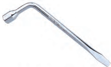
3/4 inch (19mm)