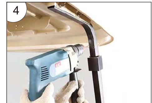
4. Use a 3mm diameter drill to make holes.