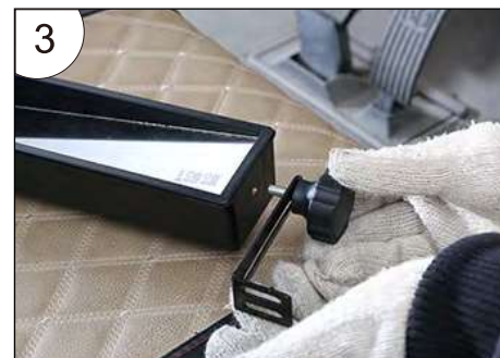
3.Screw on the torsion bolt, install the iron plate, and tighten.