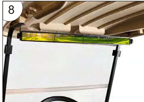
8. Installation complete.