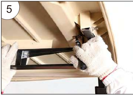
5. Mark the position of the hole according to the distance between the two bars of the body.