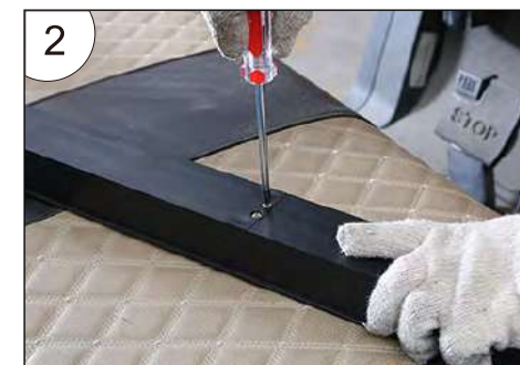
2.Tighten the screws.