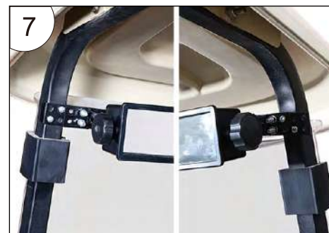
7. As shown.