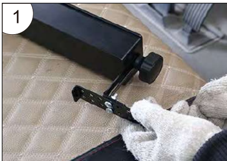
1. Add the iron sheet with holes and screws as shown in the figure.