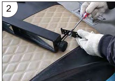
2. Tighten with a Phillips screwdriver.