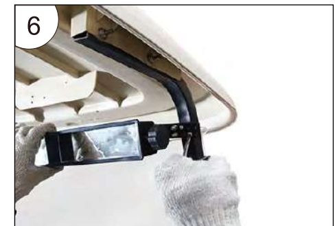
6. Use a Phillips screwdriver to tighten the screws.