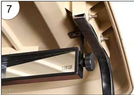
7. As shown.