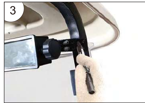
3. Mark the position of the hole according to the distance between the two bars of the body.