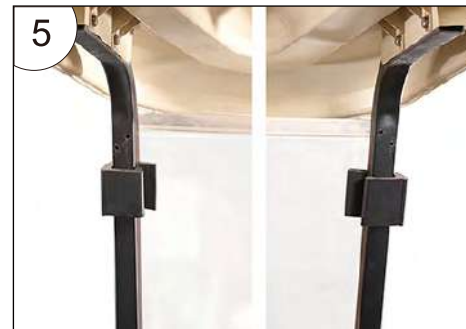
5. Holes on both sides.