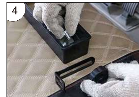
4.Install the bolt, install the iron plate, screw on the torsion bolt, and tighten.