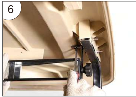
6. Tighten the screws with a Phillips screwdriver.