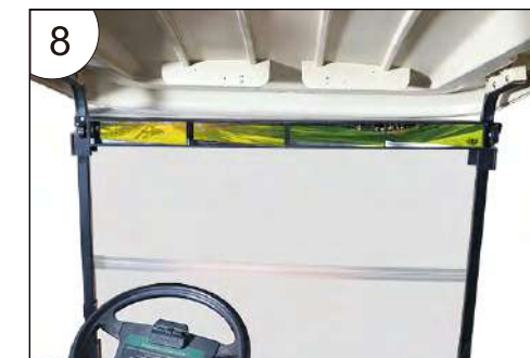
8. Installation complete.