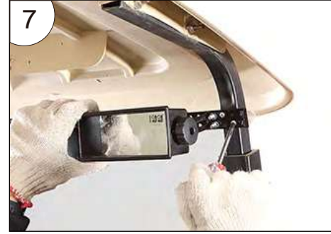
7.Use a Phillips screwdriver to tighten the screws.