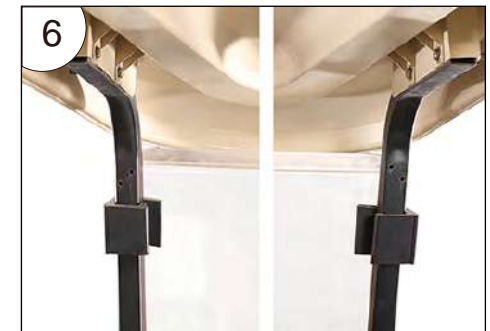
6.Holes on both sides .

mounts on roof support by extension bracket: