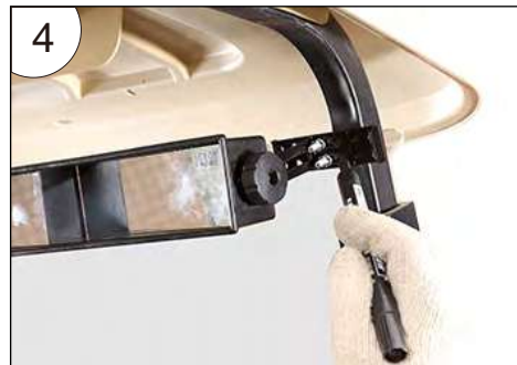
4.Mark the position to be punched with a pen according to the distance between the two rods of the body.