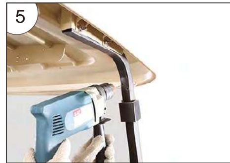
5.Use a 3mm diameter drill to make holes.