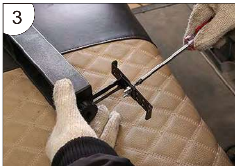
3.Use a Phillips screwdriver to tighten.