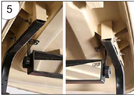
5.As shown in the figure.