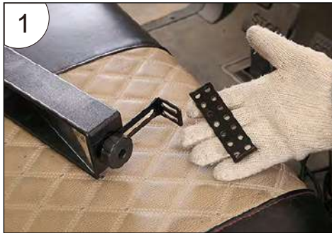
1.Join the long pole (as shown in the picture).

mounts on roof support by extension bracket: